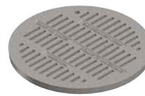
Type M2 ADA Grate Approx. 84 sq. in. open area

Available Frames for 1118 — 1120 Covers and Grates