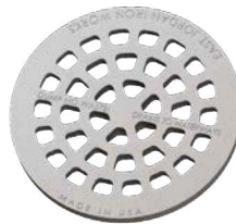
Type M Flat Grate Approx. 125 sq. in. open area